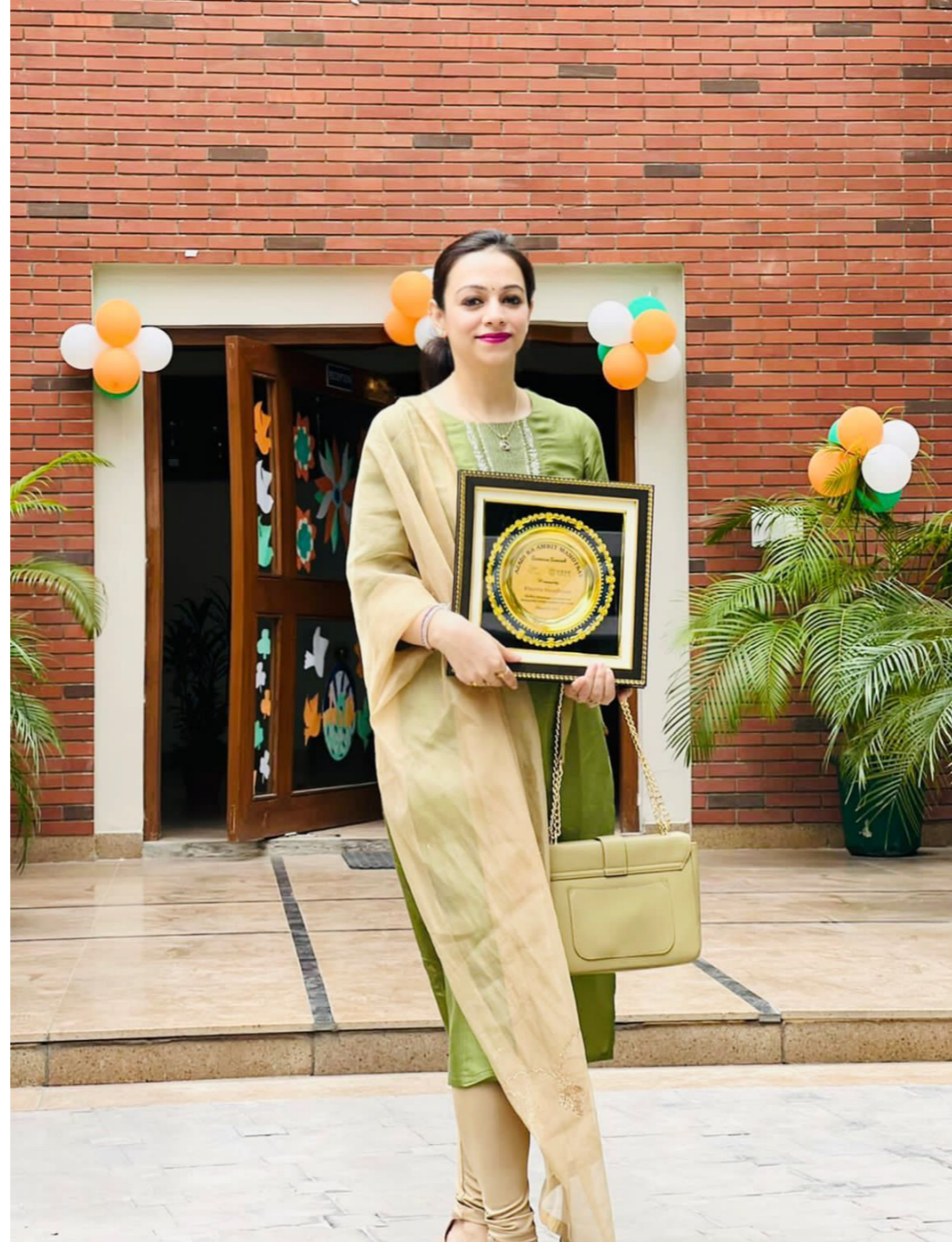
Honoured in DPSG School for outstanding contribution to society