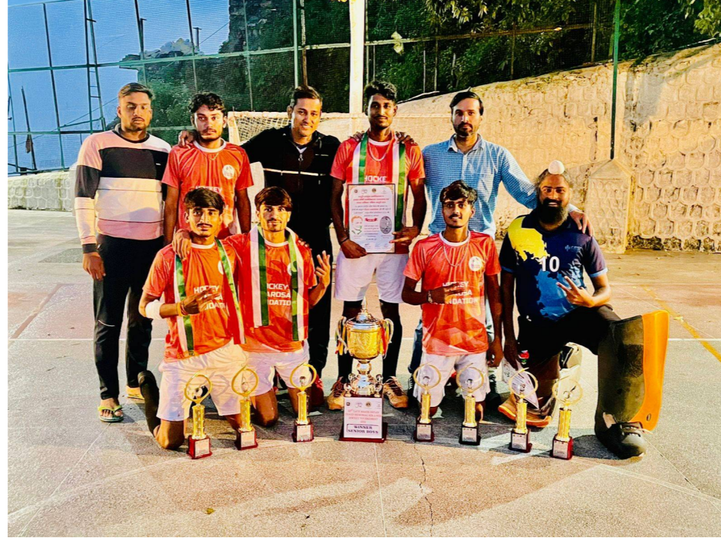
Gold medal in "23rd Six A Side Hockey Competition 2022"