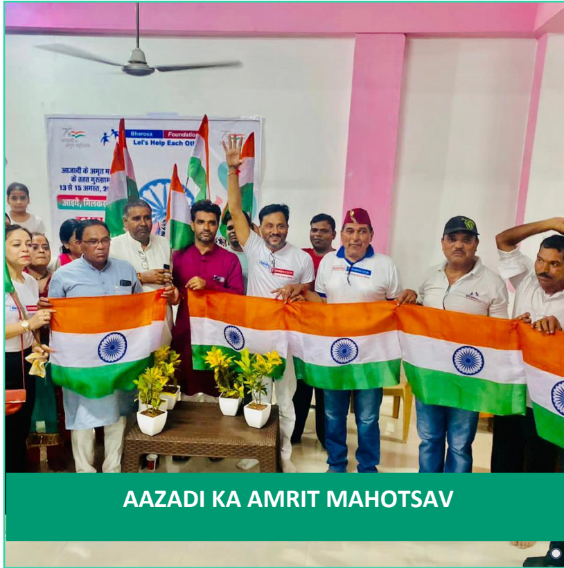
AAZADI KA AMRIT MAHOTSAV